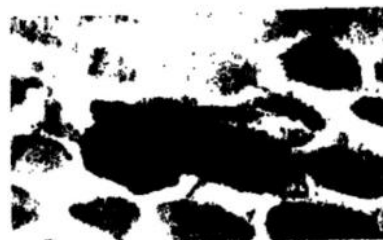
greater wax moth

Researchers in Spain and England recently found that the worms of the